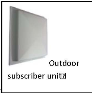
Outdoor subscriber unit

based on a Time Division Duplex (TDD) algorithm that assigns guaranteed time slots for each subscriber unit. This enables Quality of Service (QoS) mechanisms that can guarantee levels of service (guaranteed bandwidth or priority).