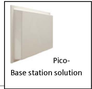
Pico-Base station solution